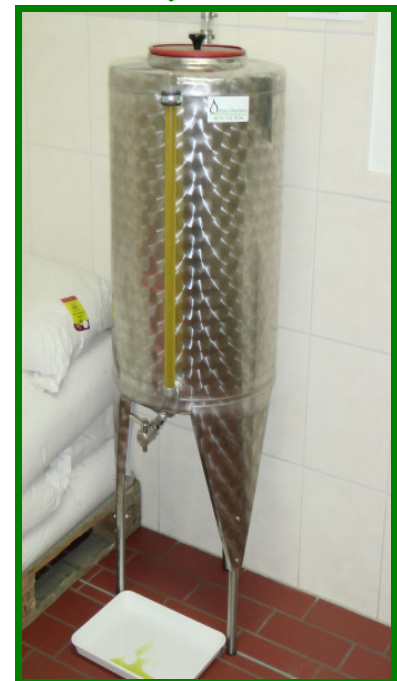
100 l filling tank with level indicator