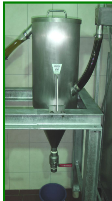
4 x 60 l sedimentation unit (stainless steel)