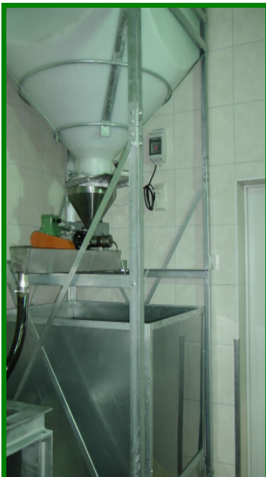
Oil press with 500 l seed container